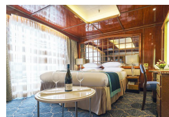
Main Deck Suite