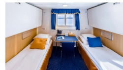
Cabin Category 5