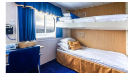
Cabin Category 3