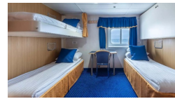
Cabin Category 2