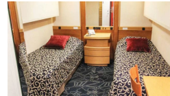
Cabin Category 4