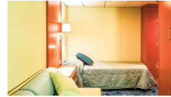
Cabin Category 3