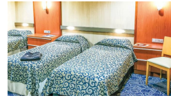
Cabin Category 10