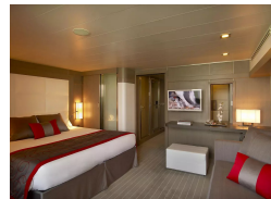
Grand Privilege Suite