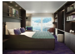
Quadruple Porthole Superior