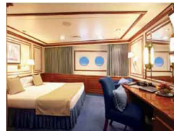
Category 1. From