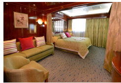
Byrd Deck Superior Suite