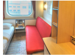
Polar Inside. From