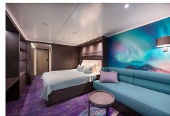
Superior - Sole Occupancy