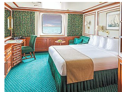
Category 3 Solo