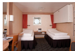
Cat 3 - Twin