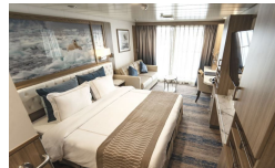
Balcony Stateroom - B