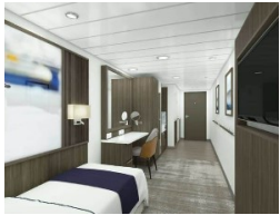
Aurora Stateroom Triple