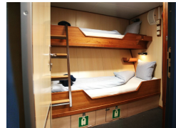
Twin Private Porthole