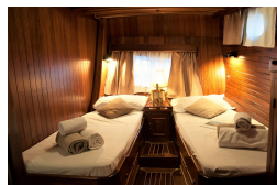
Single occupancy of Double/Twin Cabin