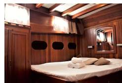
Single occupancy of Double/Twin Cabin