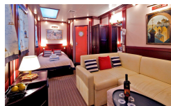
Main Deck Premium. From