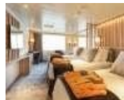
Deluxe Balcony Suite