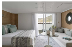
Grand Deluxe Suite - Waitlist