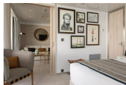
Prestige Stateroom Deck 4 - waitlist