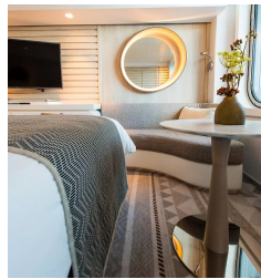
Deluxe Suite - waitlist