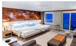
CORAL DECK STATEROOM