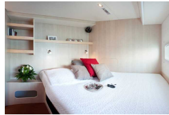
Double Cabin with Sole Occupancy