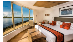
Deluxe Master Suite