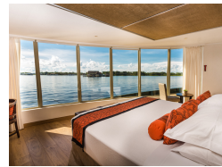
Deluxe Master Suite