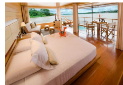
Deluxe Master Suite